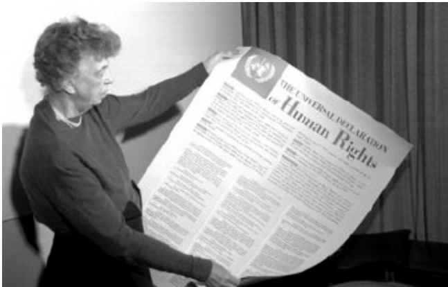
Mrs. Eleanor Roosevelt of the United States holding a Declaration of Human Rights poster in English. November 1949. Dec. 3, 2008 also marks its 60th Anniversary. (Eleanor's husband, Franklin D. Roosevelt, was diagnosed with poliomyelitis in 1921. He later founded the National Foundation for Infantile Paralysis, which grew to be known as the March of Dimes in the U.S.)

Wednesday, December 3rd, 2008 has been named by the UN as the International Day of Persons with Disabilities (changed from the International Day of Disabled Persons). The day also marks the 60th anniversary of the Universal Declaration of Human Rights. That day, people all over the world will be observing the basic human rights principle, "dignity and justice for all of us." According to UN statistics, it is astounding to realize that approximately 10 per cent of the world's population, or 650 million people, live with a disability. This is then the world's largest minority. If family members are taken into account, the number jumps to 2 billion people directly affected by disability. This represents almost a third of the world's population!