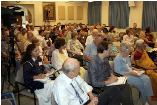
June 5th participants at the Healthy Connections 2008 conference heard from a distinguished group of presenters, and then worked on health inequity solutions in break-out groups at Ryerson campus in Toronto

For those whose task it is to eliminate barriers to access and create inclusion, the book An Imperfect Offering reminds us that leadership and creativity are prime ingredients in achieving workable answers – and, given what governments can realistically do with increasingly scarce resources, the role of the NGO (the non-governmental organization) is perhaps more potent and integral than ever before.