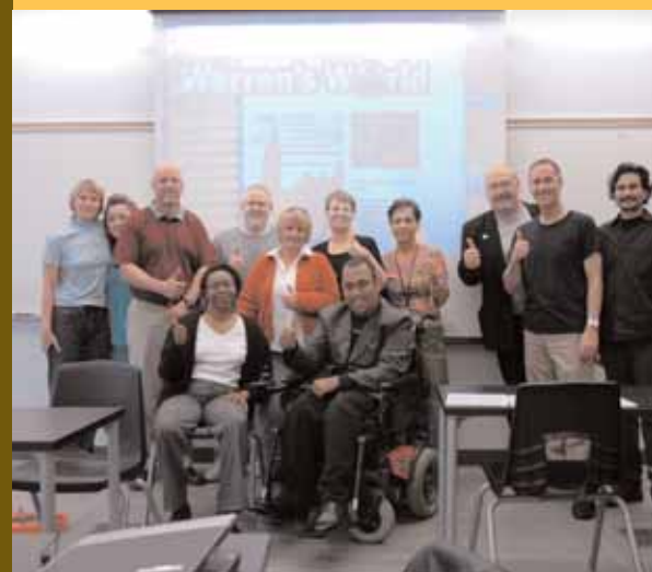
May 26 - Centennial College. The Warren's World lecture on accessibility and advocacy to Centennial faculty