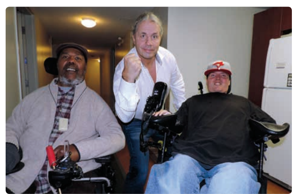
Bret "the Hitman" Hart with Tenants at Meynell House

Historically, the waterfront area has been a neighbourhood with fewer services and less access to transportation than most areas of the city. NPHC is working with March of Dimes Canada towards building a relationship with the nearby development planned to support the 2015 Pan Am/ParaPan Am Games. The Pan Am/ParaPan Am Village will greatly change the neighbourhood and full accessibility and inclusiveness is envisioned.