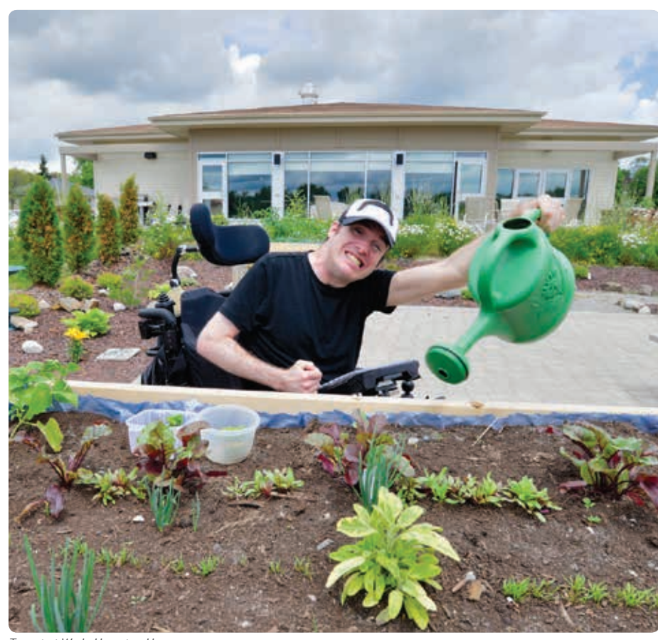
Tenant at Wade Hampton House