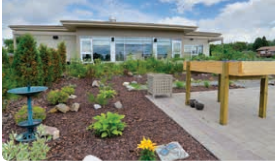
Wade Hampton House