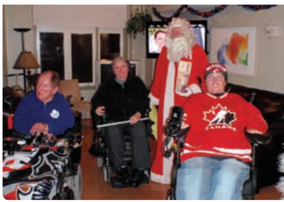
Meynell House Consumers and Santa Claus - Holiday Celebration 2013